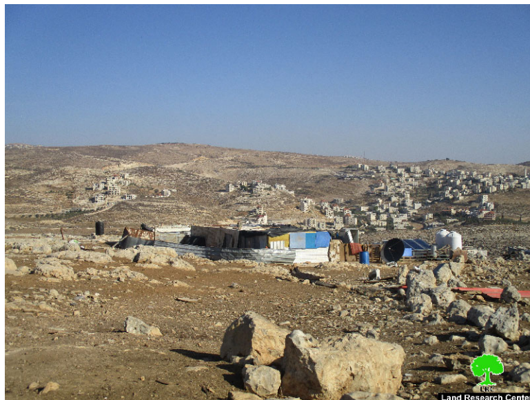
Al-Maa'zi Bedouin community