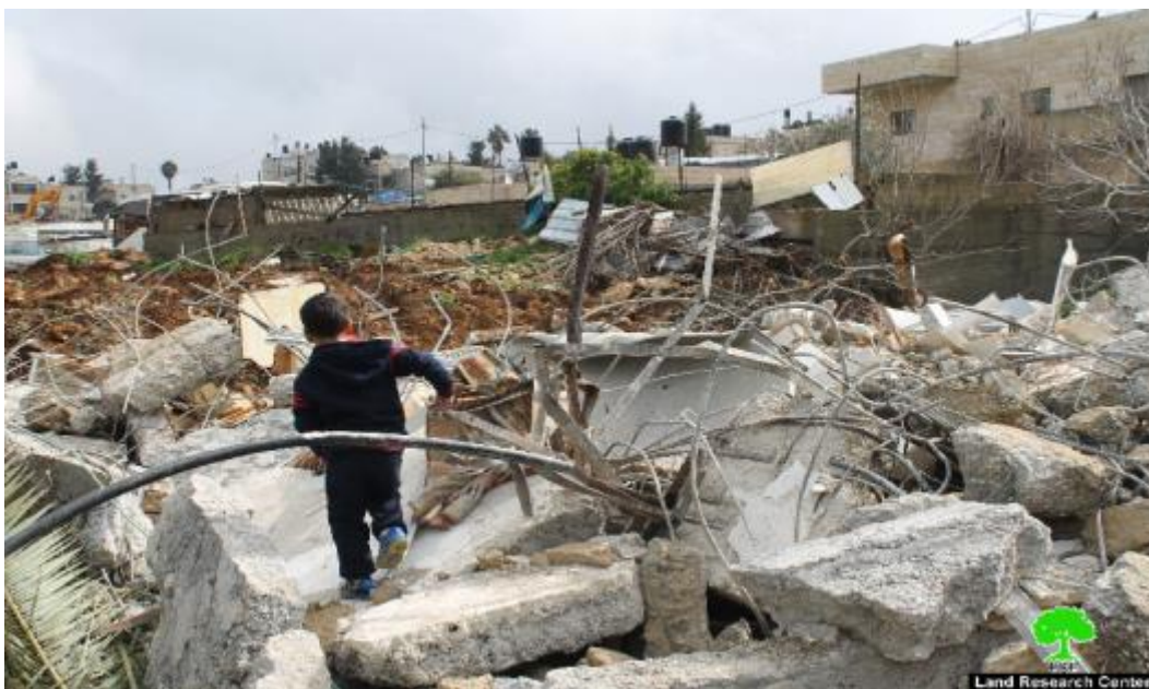
From the demolition operation on Al-Rishiq's