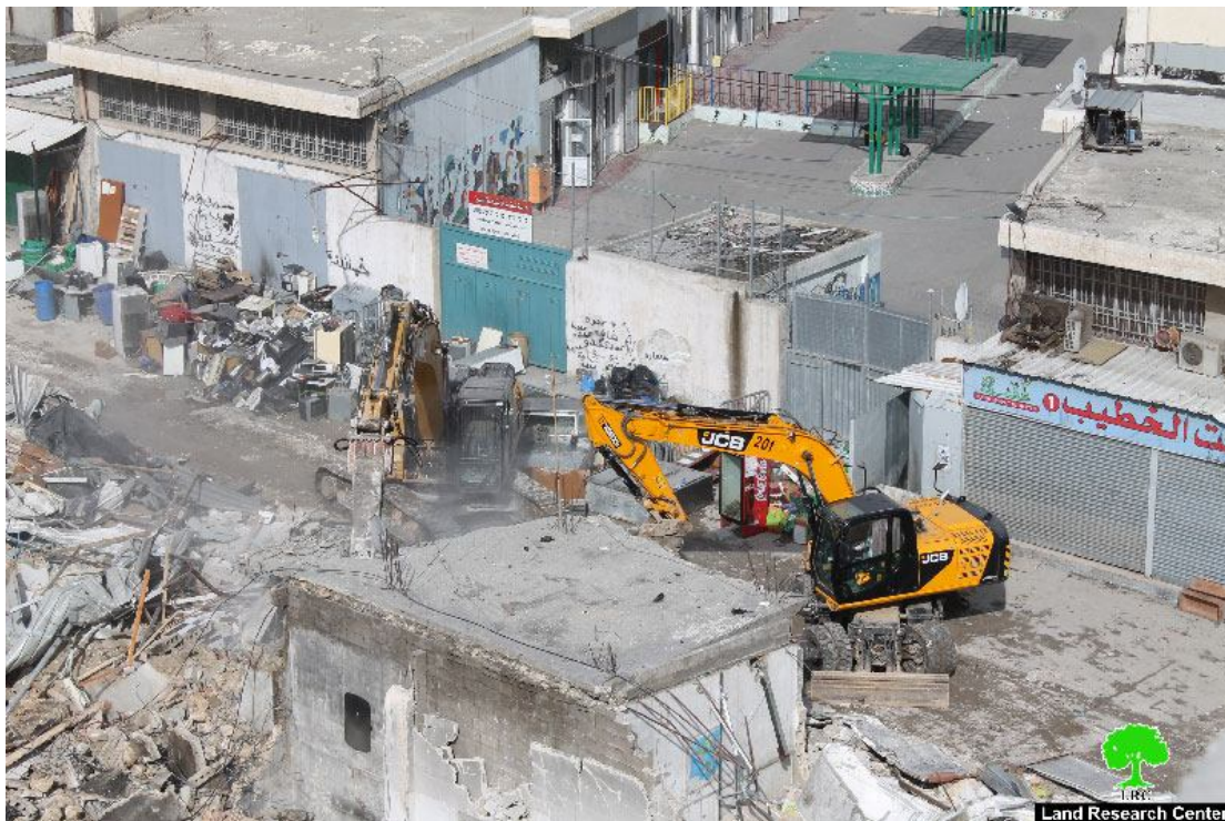
At time of attack