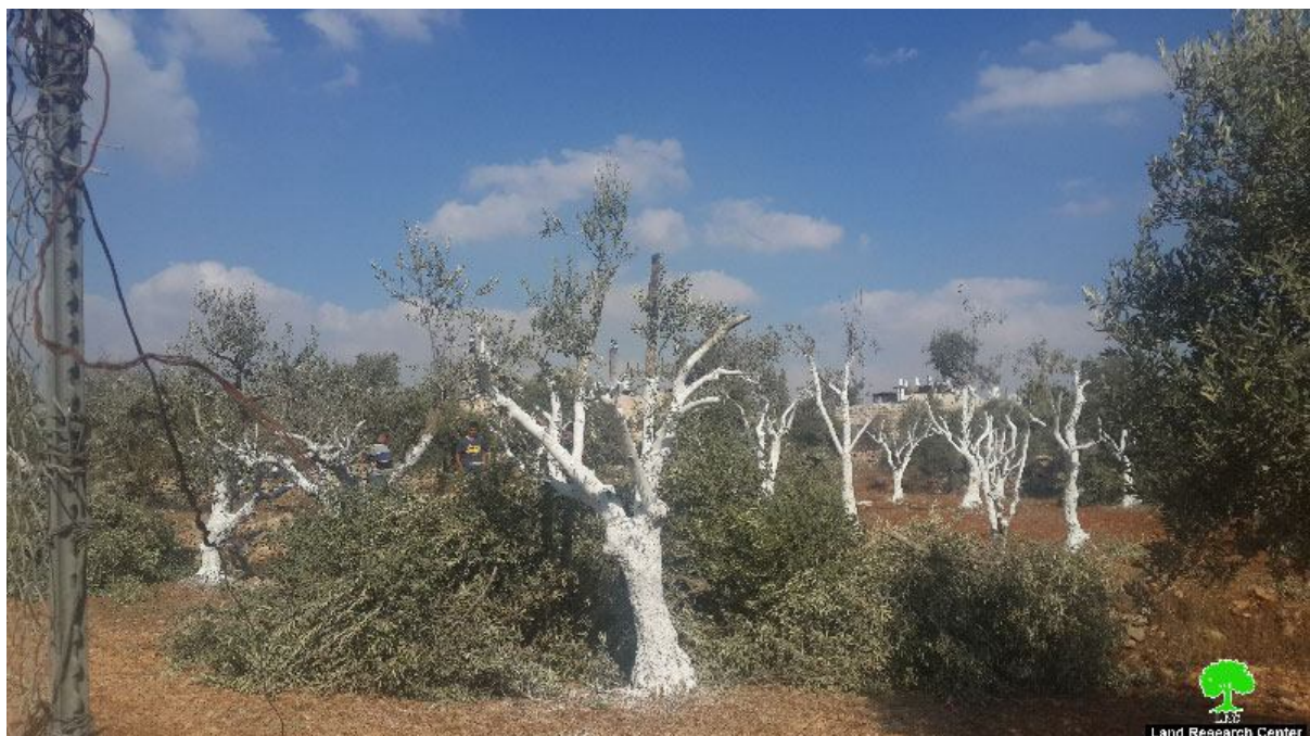
Beit Safafa trees before being uprooted

Also, dozers of the occupation uprooted and ravaged a number of fruitful trees in the village of Shu'fat, north occupied Jerusalem for the sake of opening new occupational roads holding the numbers 20 and 21. Noteworthy, the number of uprooted trees reached 150 , where a big number of other trees are threatened of ravaging as per continuing the roads' opening. It should be marked that the Israeli authorities moved the uprooted trees to an unidentified place via trucks relative to the army.