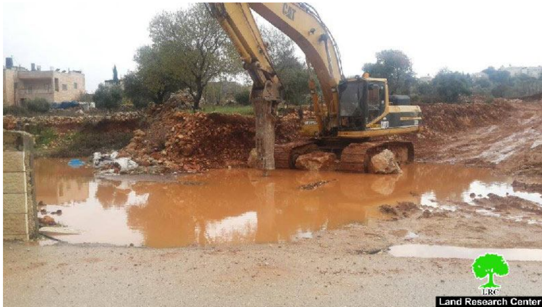
Occupation dozer open the bypass road no.29 on lands of Beit Safafa