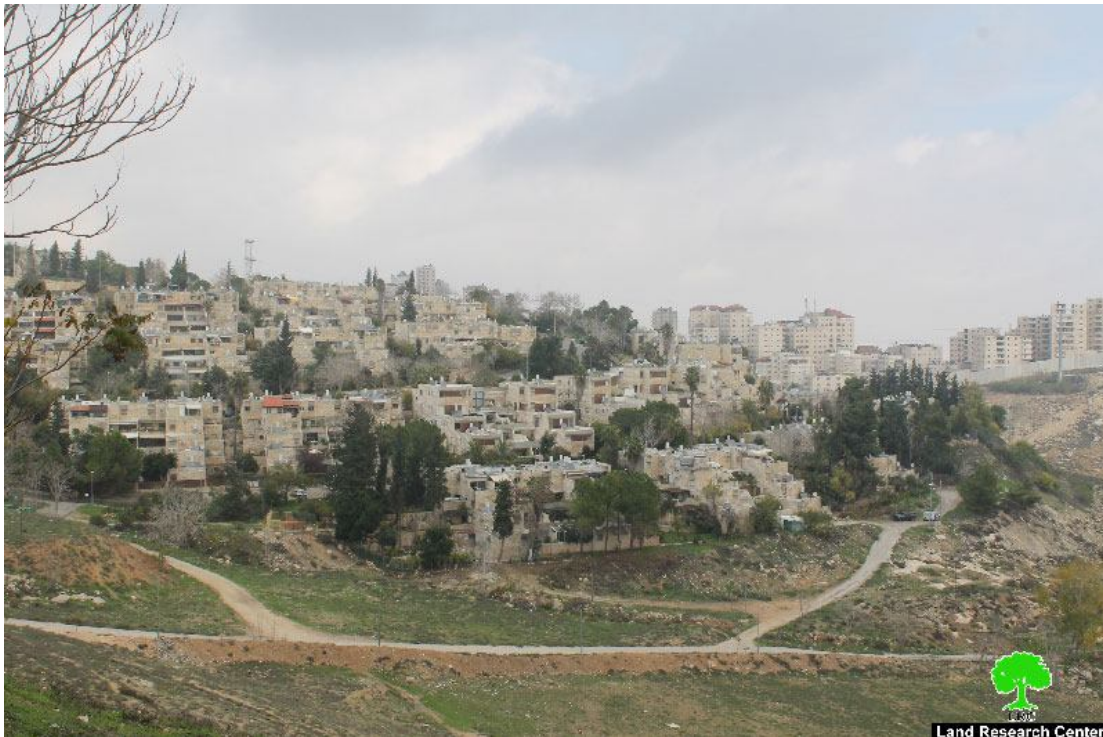
Al-Tallih al-Faransia colony