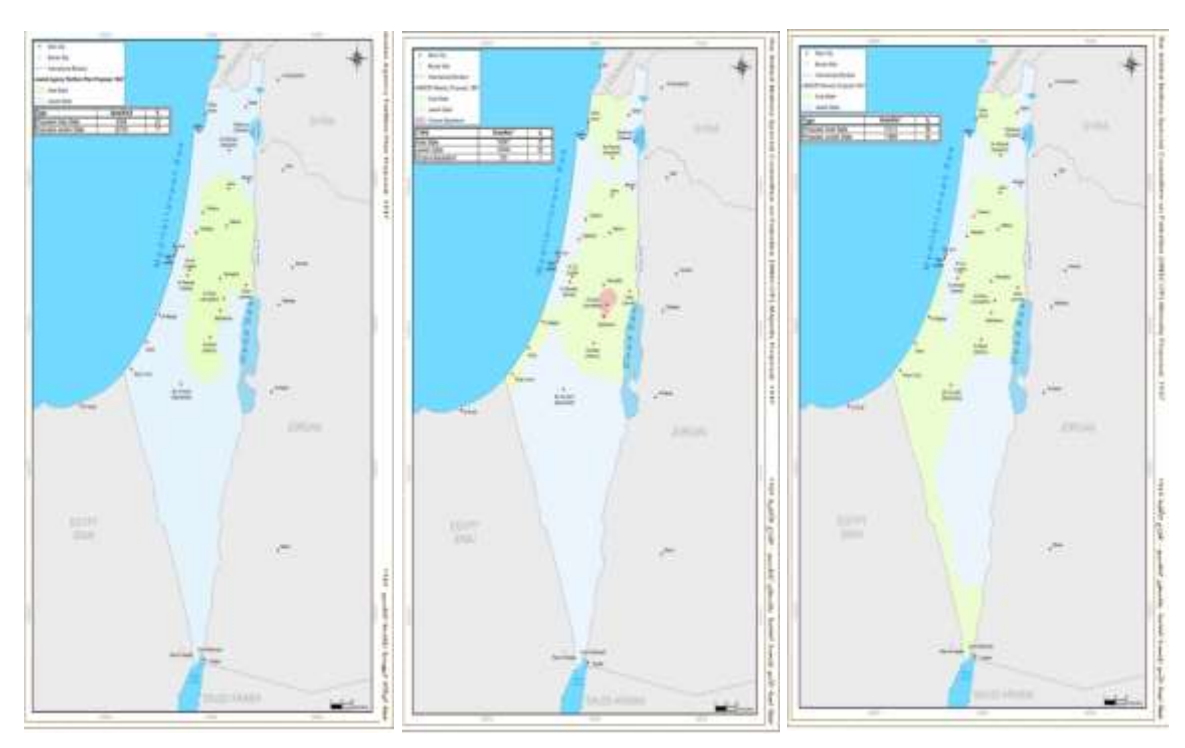
The Minority Proposal

The fourth proposal of 1947 came later on, when it became more evident that the British days in Mandate Palestine in a countdown status. On November 29, 1947, the United Nations adopted and voted in favor of resolution 181 with the full support of the United States and the endorsement of US President Truman. The partition plan was set to proceed in phases; starting with actual termination of the Mandate and the gradual withdrawal of the British Army in parallel to marking the boundaries between the two states to be. the partition designated territory equal to 57.2% of Mandate Palestine for the Jews to establish their State and 42.1% for the Palestinian to establish their State; while identifying the remaining 0.7% for Jerusalem, which was set to fall under international administration.