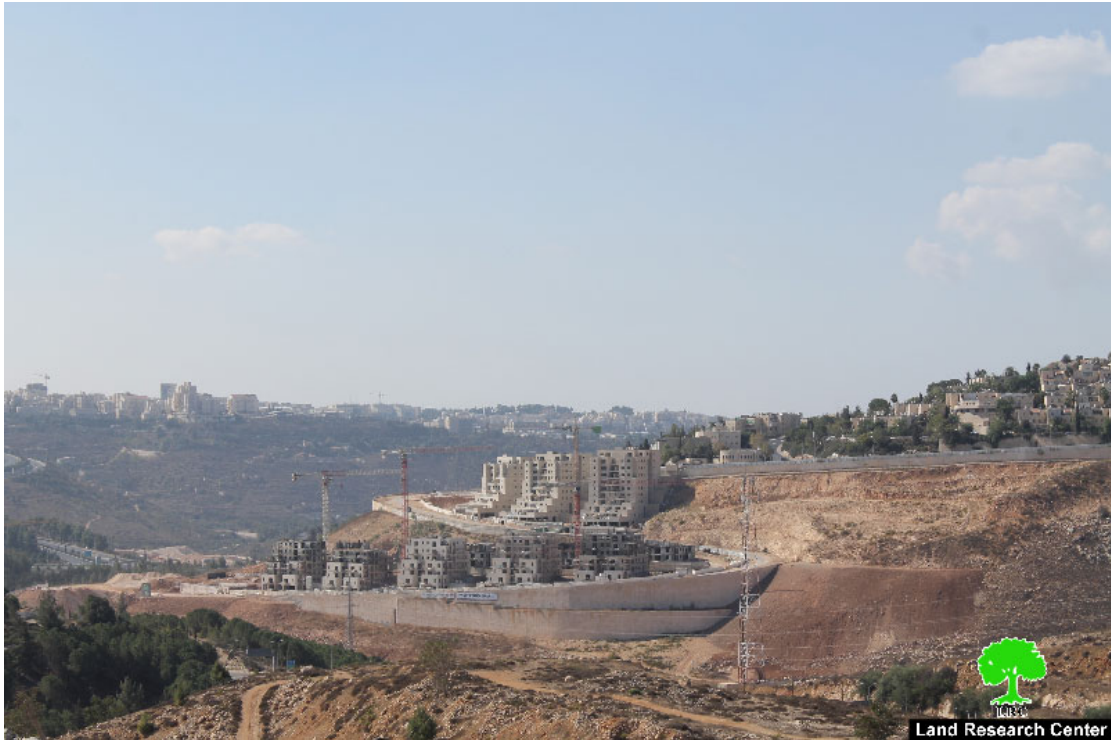
Pisgat Zev colony expanding at the expense of Palestinian lands

It should be marked that the demolished residences are located in front of Rekhes Shu'fat colony, where tens of colonial units are being illegally built in a step to expand the area at the expense of Palestinian lands.