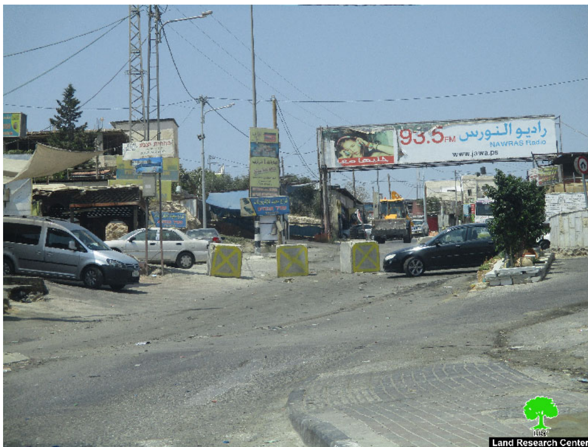
the eastern entrance of Hizma town closed via road blocks