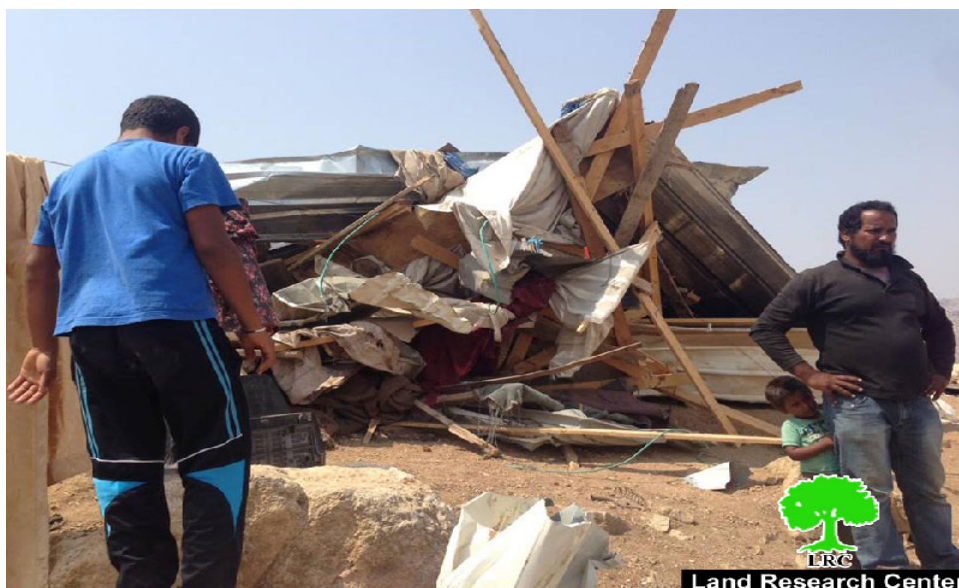
views from the demolition operation

The following table shows information about the affected people and properties: