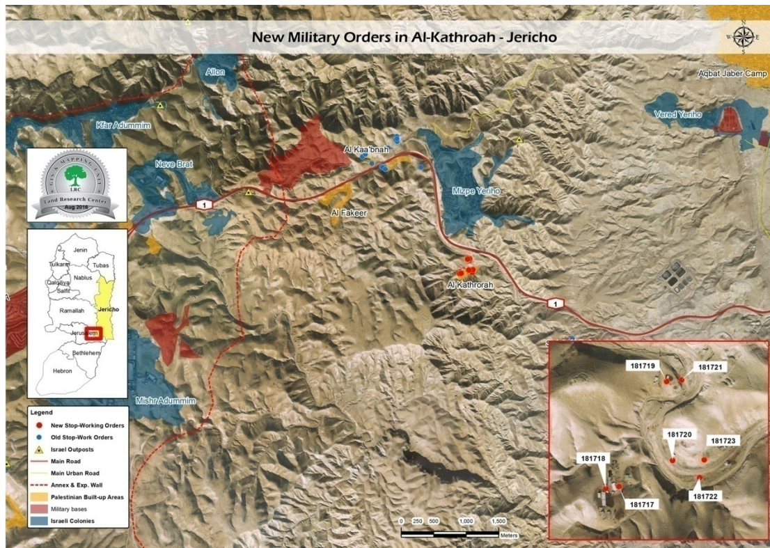
Map of the Bedouin community