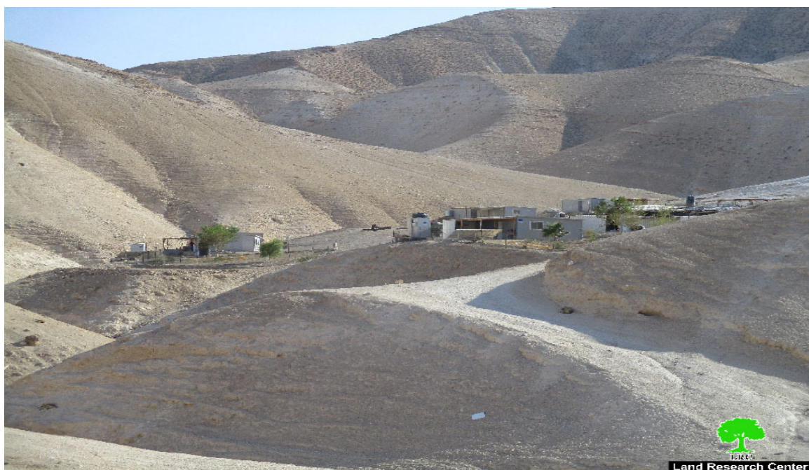
views from the targeted community