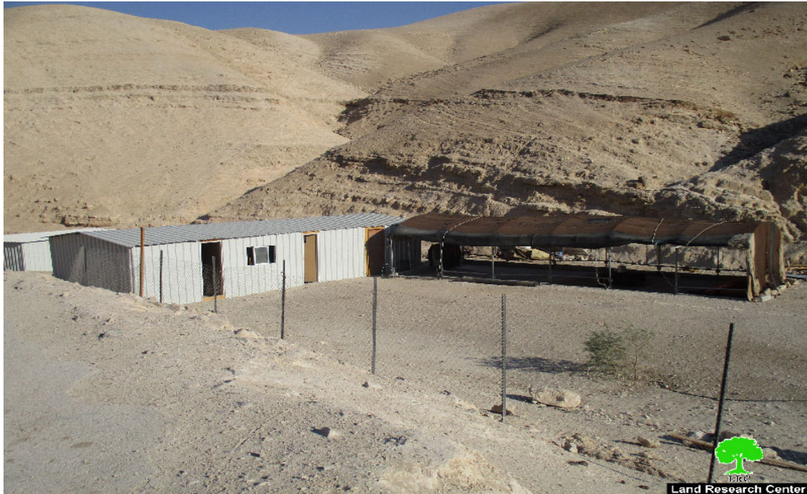
the "gatherings room" and the kindergarten