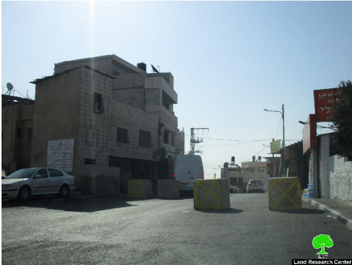
the western entrance of Hizma town closed via road blocks