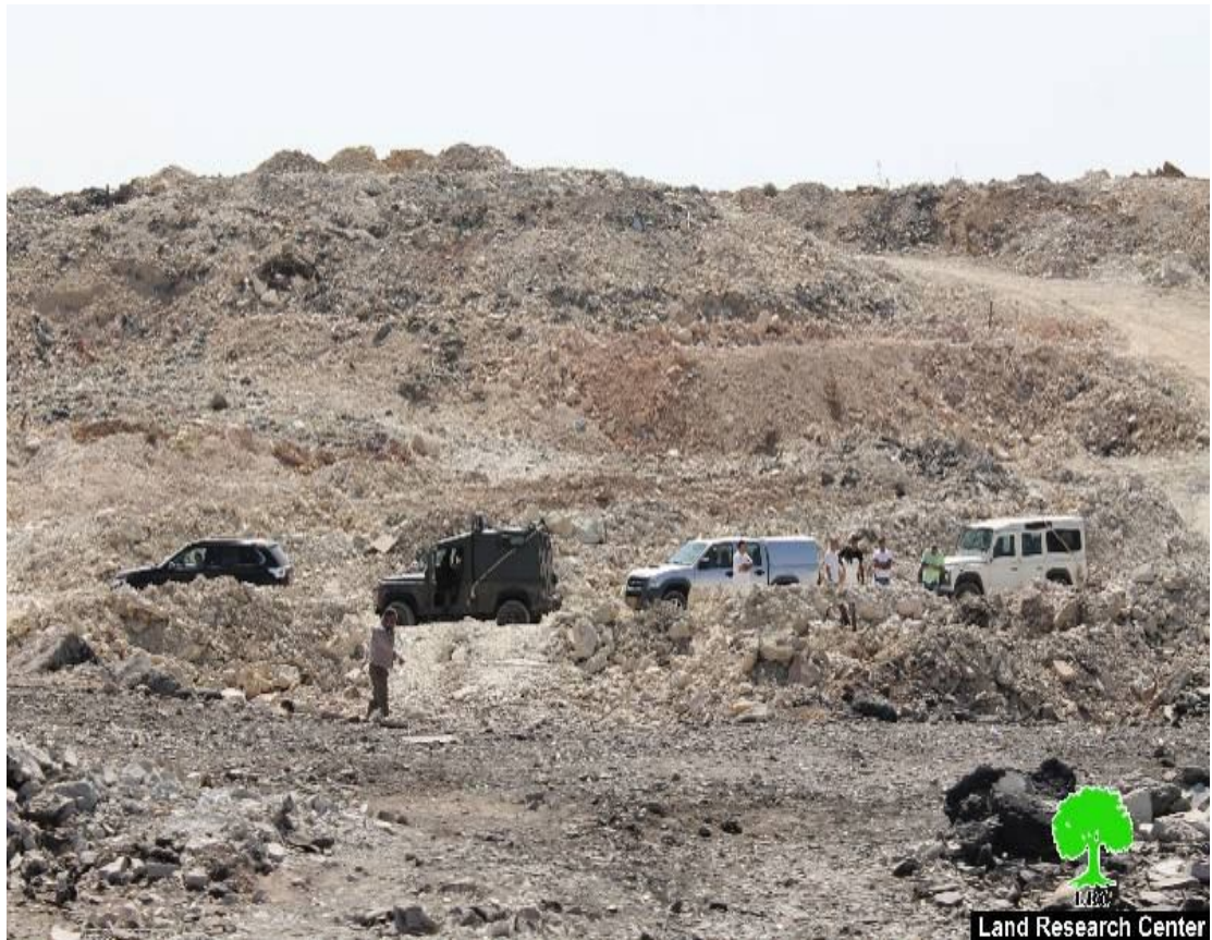
The proposed location to house the Palestinian communities in