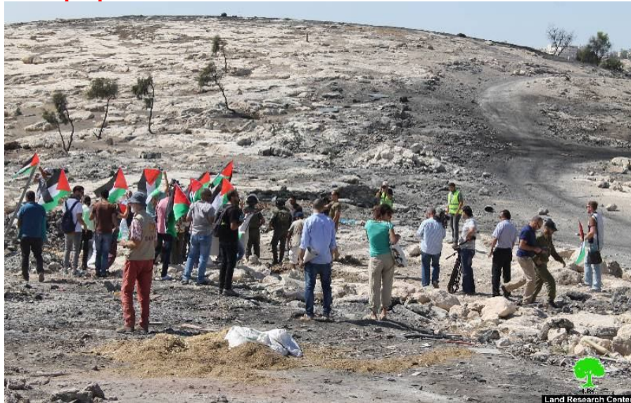
Landlords, Bedouins and international activists protest the occupation plan