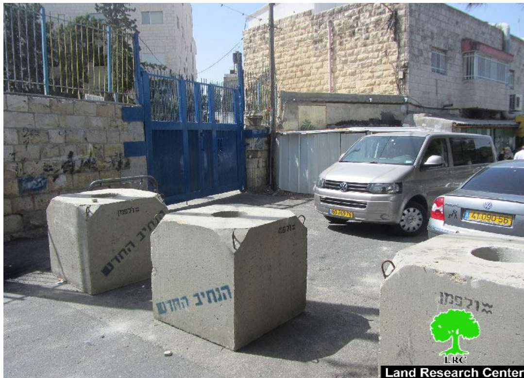
Entrance of Al-Tur town- Suleiman Al-Farisi Street

Land Research Center sees that closures are blatant violations of international laws and conventions, some of which are: