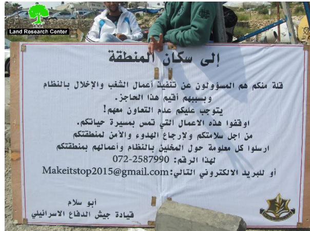
The sign at the entrance

On 13 April 2015, at approximately 7:00 A.M., the military sealed off both entry points to the village and prevented vehicles from leaving the village, claiming that residents of Hizma had thrown stones at the road. At the northern entrance, soldiers placed concrete blocks with a sign reading: “To residents of the area: Several of you are responsible for carrying out riots and disturbances of the peace, which resulted in the erection of this barrier. Do not cooperate with them! Stop these actions, which harm your daily lives. For your welfare, and to restore quiet and security to your area, send us any information you have on these disturbers of the pace and their activity in your area to this number: 072-2587990 or to the following email address: Makeitstop2015@gmail.com . Abu Salam, Israel Defense Forces Headquarters”.