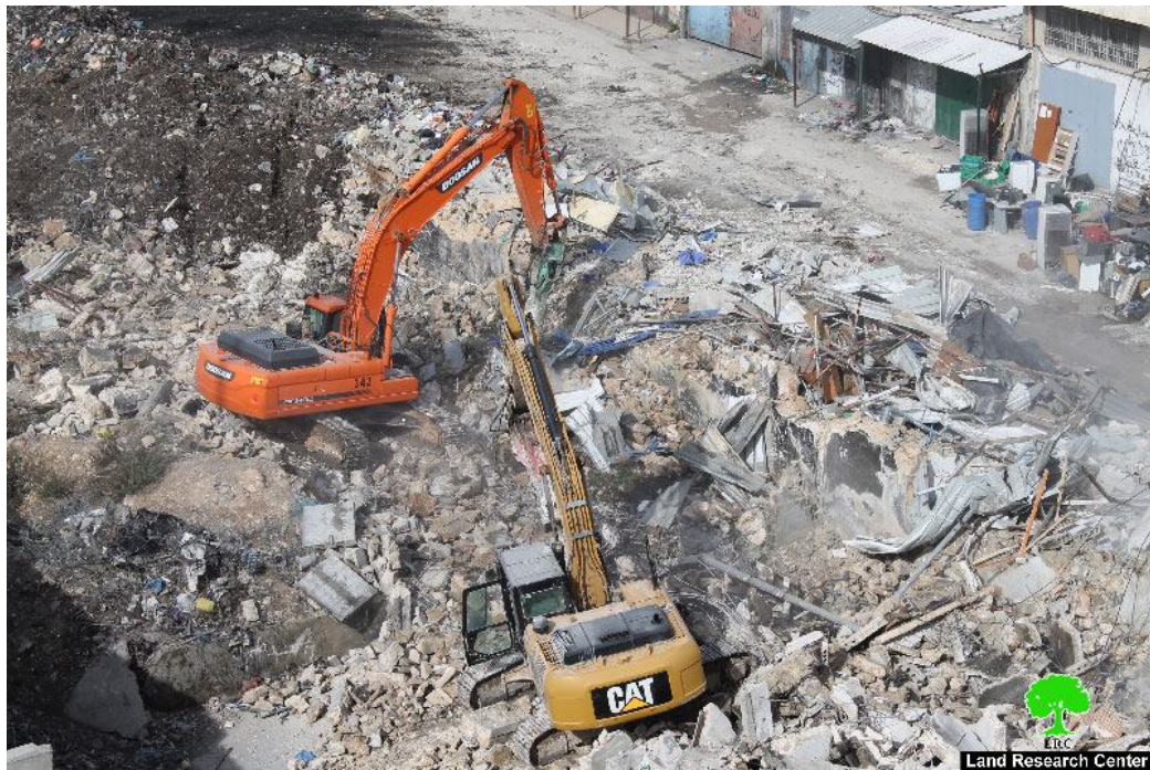
Structures of AL-Dajani family being demolished

It should be marked that the demolished stores were established since 2004. Shops included used items stores, vegetable shop, car maintenance workshop, butcher shop and some stores belonging to Al-Dajani family. Israel Supreme Court ordered Al-Cola building and its 800m 2 facilities demolished on the claim of "security purposes" despite being founded since 1963.