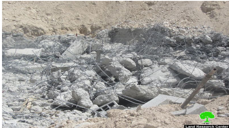
Rubbles of the demolished building

At dawn, a massive force from Israel Police and two dozers came to the place and closed all roads to the targeted buildings. Minute later, the dozers embarked on demolishing the building, leaving losses estimated of 1000,000 NIS.”