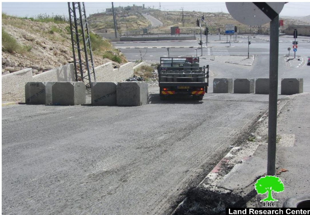
Eastern entrance of Al-Isawiya closed by cement blocks

Mohammad Abu Hummos, member of follow-up committee in Isawiya, explained that the occupation forces partly closed (sides only) the entrance of the village and pointed out that the partial closure is more like a full closure because it will lead to heavy traffic jams in the street that is used by hundreds of vehicles daily. The closure also made it very hard on busses to go and out of the village.