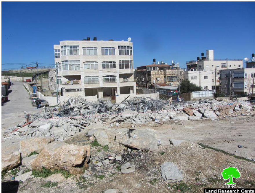
The rubbles of Bsharat' residence