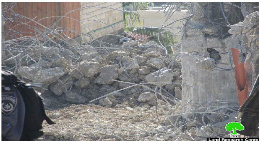
The rubbles of Ruba'iya's

On January 18, 2015, I received a self-demolition order on my house, which is to be carried out in a period between 24-48 hours. Next day, three dozers came to the palace and leveled the house to the ground. My losses totaled 100,000 NIS.”