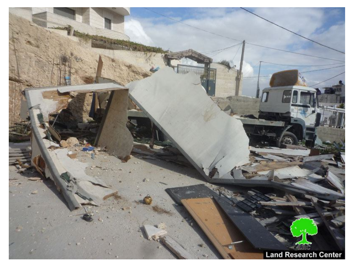
Al Juba's shelter after being torn down

Under the pretext of unlicensed construction and fines, the family of Ali Al Juba had to demolish their house and remove the ruins of it. Al Juba are 10 people, including 8 children who have been living in a container (van-like) since 2007 after the Israeli occupation demolished their residence in Al Gharsat, As Sahl neighborhood in At Tur. Their house had been under construction.