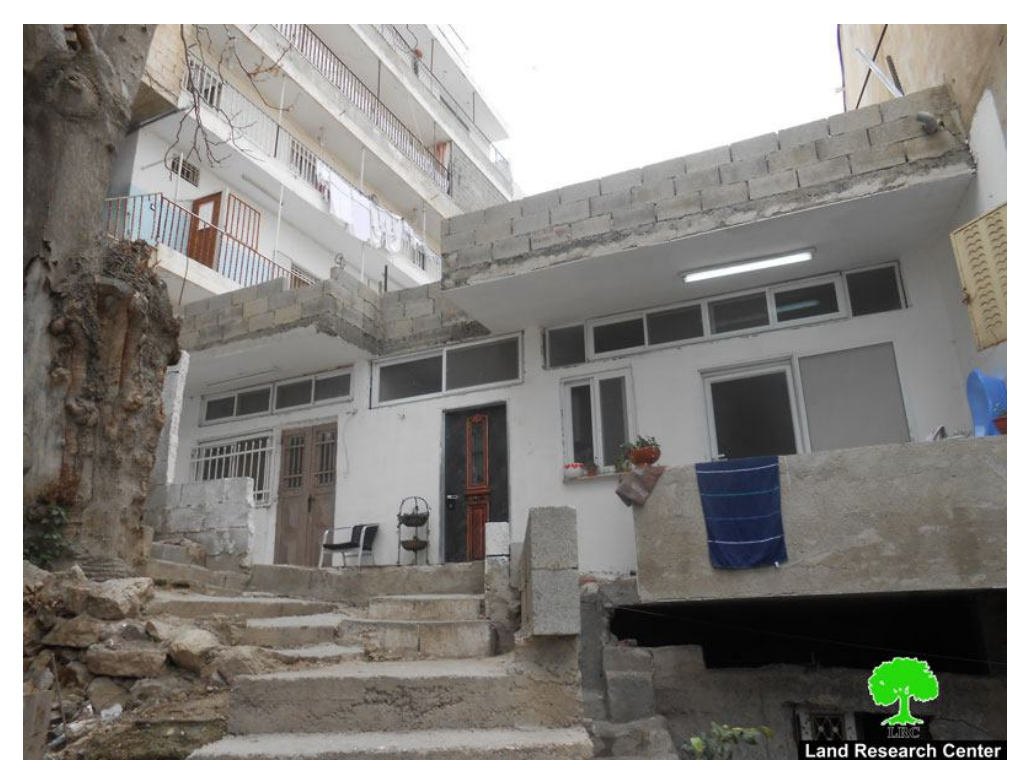
Saim's threatened structure