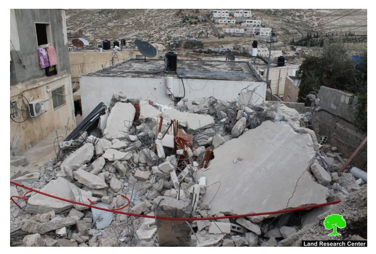
Bashir's house that turned into wreckage