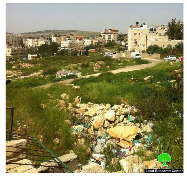
Piece of Al Natsheh's targeted land- Beit Hanina

• On Feb 08, the Israeli occupation reveals its intentions to construct 22 colonial units in Beit Hanina on a piece of land confiscated from 3 families of Al Natsheh on April 18, 2012 after the Israeli magistrate's court ruled in favor of Israel Land Fund (ILF) and ordered Al Natsheh to move out.