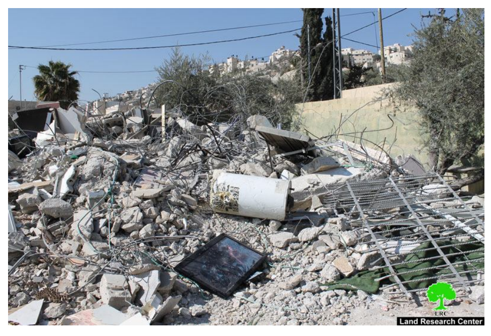
Sawahra's residence after being destroyed