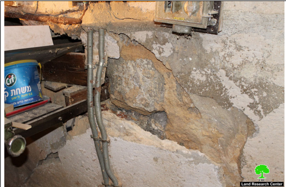
The cracks in the carpentry shop

Abu 'Asab stated to an LRC observer that: