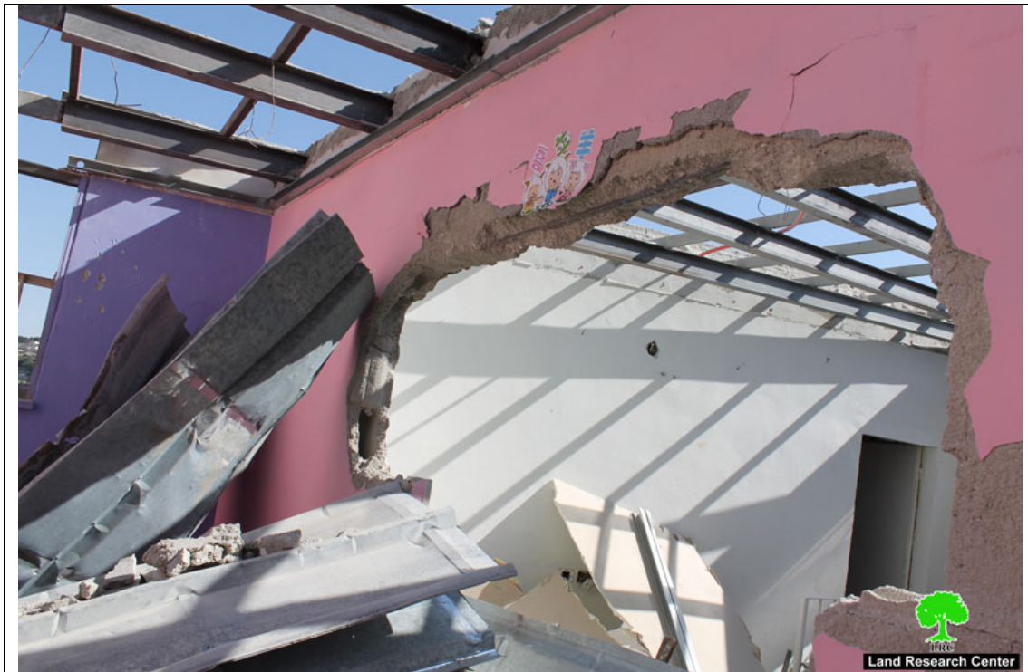
Z'atara's house during the demolition operation