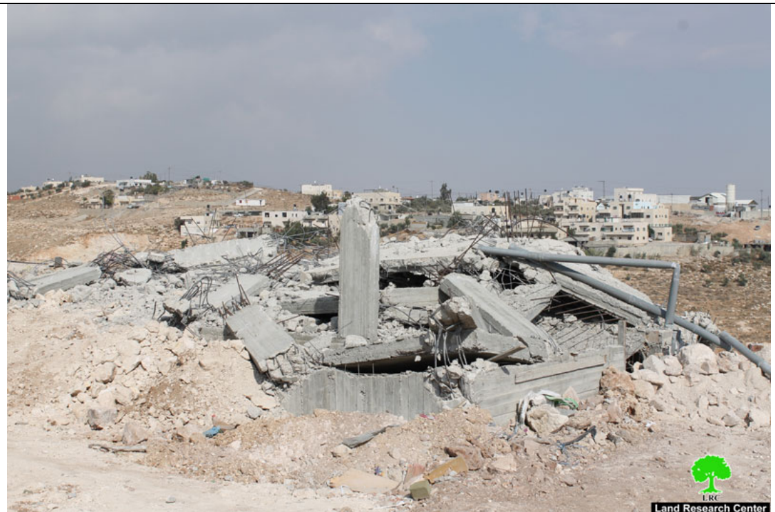
Ameera's house reduced into rubble

On November 30, 2013, we brought two bulldozers and leveled our residences. We paid 4000 NIS for each bulldozer, let alone other losses which are estimated to be 500,000 NIS.