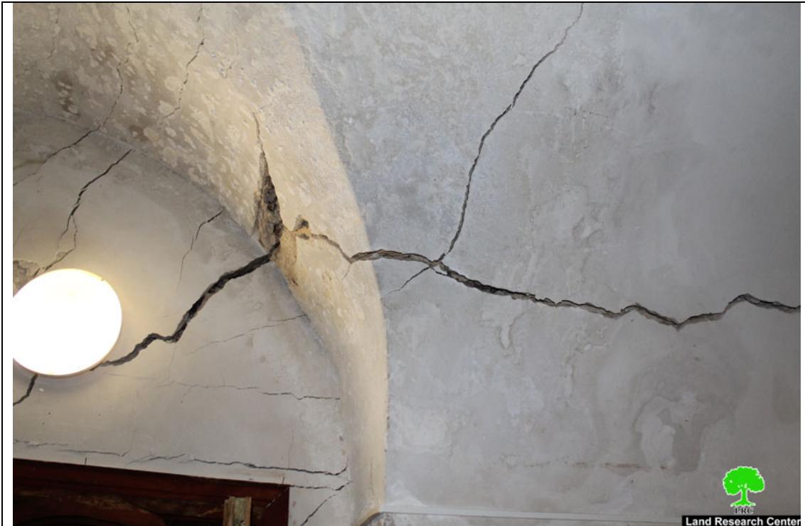
Cracks in the walls of Zaghlol's residence due to the Israeli excavations

During the past ten years, cracks have been more obvious and increasing. Lately, collapses in the alleys in Hush Osila took place. Four months ago, the family reconditioned the walls in an attempt to get rid of the cracks only to have them reappear again. This is a dangerous status since we are at the doorstep of the winter season. That means that the cracks will soon be leaking water and might cause the collapse of the residence."