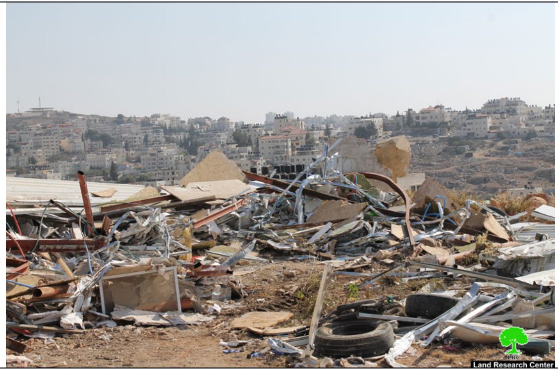
The destruction ensued by the Israeli heavy machines

The Israeli bulldozers demolished two sheds that belong to Castero family in Beit Hanina, north of Jerusalem, after giving them a 24-hour notice. The demolition was carried out under the pretext of illegal residence. It is worth knowing that the state municipality demolished a 4-storey building for the same family in February, 2013, for unlicensed construction.