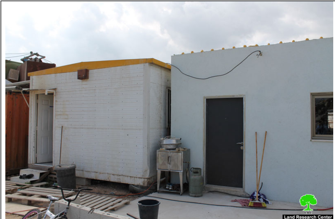
The two living tents threatened to be demolished by the state municipality