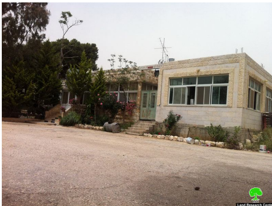
Al Maslamani and Jamjoum Residences

He concluded: "it is our right to remain here; Israel is vanity; and I would rather die here than leaving".