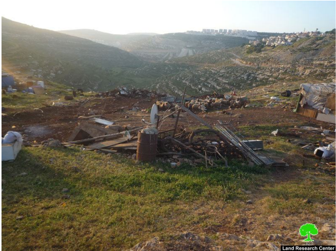
Destruction in Al Jib