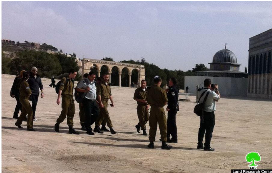
Israeli troops taking pictures of the Mosque

Defilement, stealing of antiques and artifacts, changing the shape of the mosque and its facilities, and other sorts of attacks continue unabated.