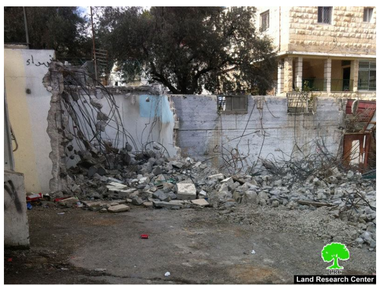
The remains of the workshop

He was given the choice of demolishing it himself or the Municipality does on his own expense.